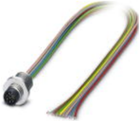
Sensor/actuator flush-type plug, 8-pos., M8, front/screw mounting with M10 fastening thread, with 0.5 m TPE litz wire, 8 x 0.14 mm²

Please be informed that the data shown in this PDF Document is generated from our Online Catalog. Please find the complete data in the user's documentation. Our General Terms of Use for Downloads are valid ( http://download.phoenixcontact.com )